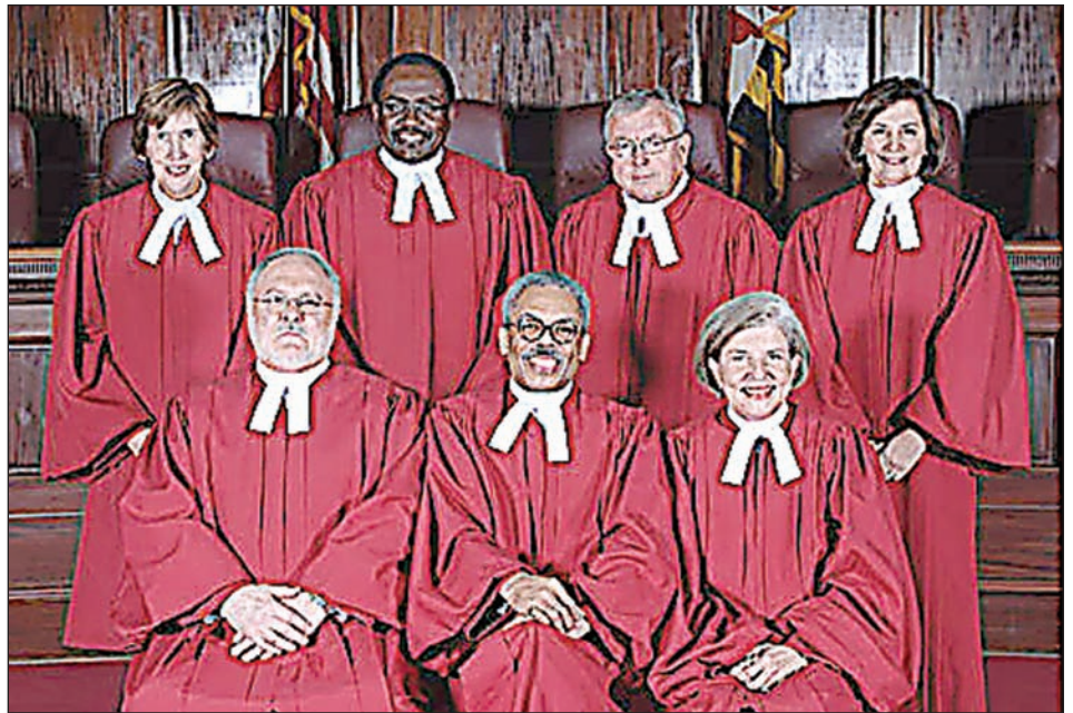
The Court of Appeals opens its new term on Wednesday.

His petition attracted the attention of University of Baltimore School of